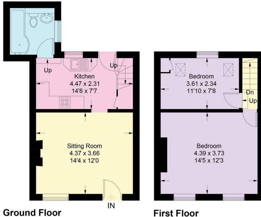
Illustration for identification purposes only, measurements are approximate, not to scale. Fourlabs.co © (ID1248187)